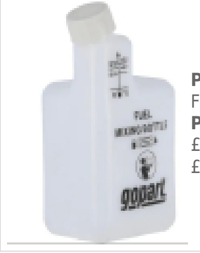
Part No: FGP250001GP Price: £6.23 (exc VAT) £7.48 (inc VAT)